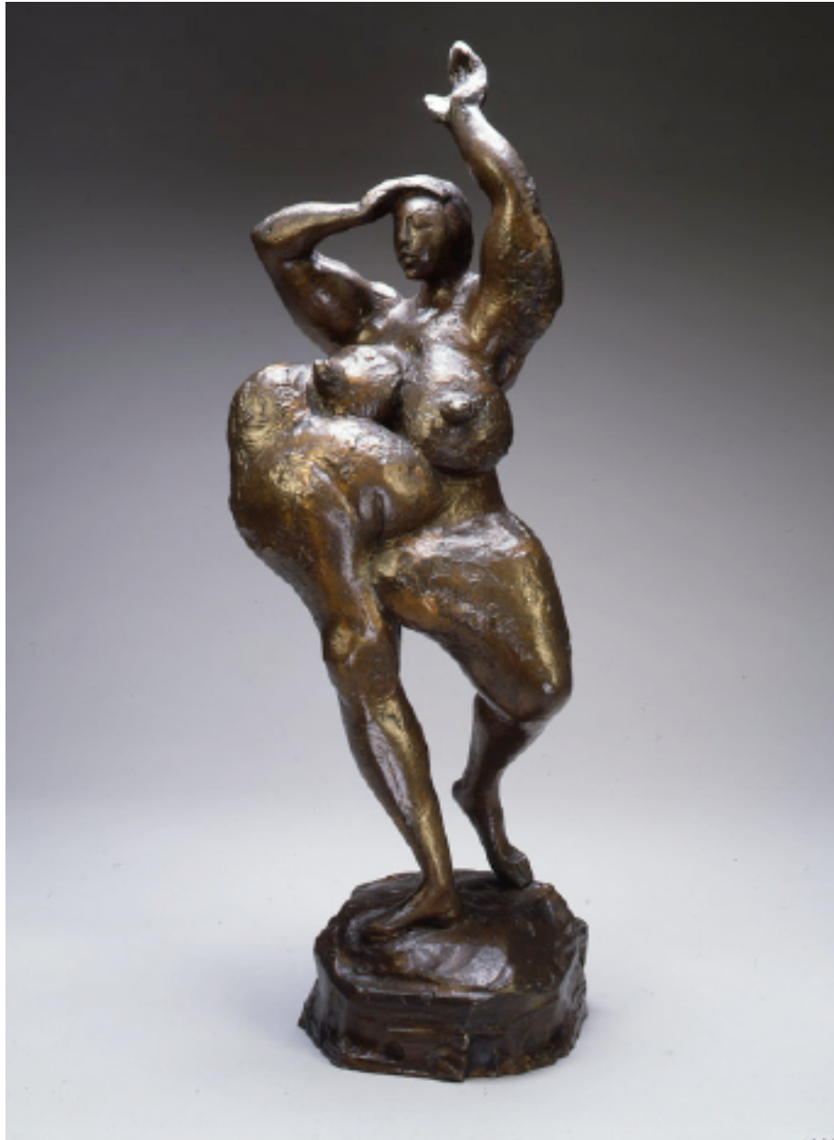
PLATE 3 Gaston Lachaise, Burlesque Figure , 1930, bronze, 24 x 8½ x 6 inches (62.2 x 21.6 x 15.2 cm).