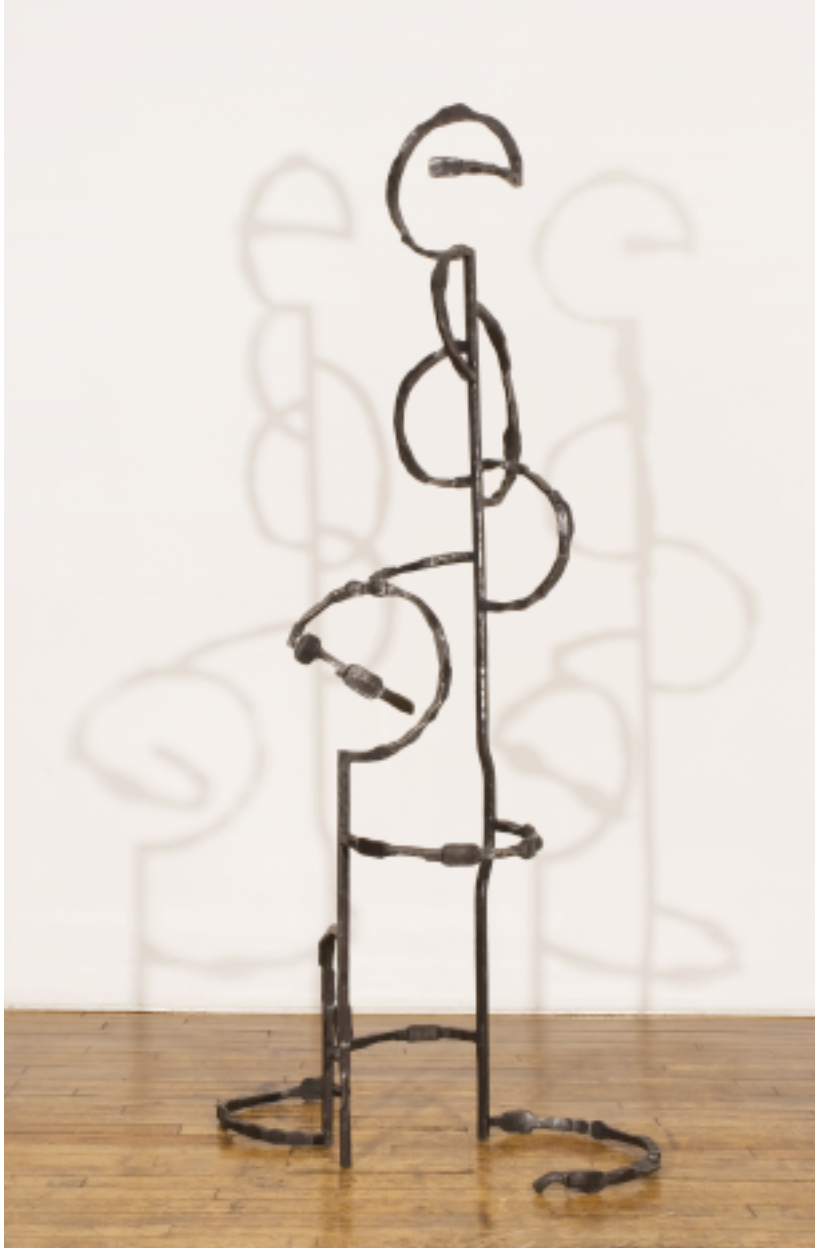
PLATE 4 Alain Kirili, Nataraja I , 2006, forged iron, 101 x 47 x 23 inches (255 x 120 x 89 cm)