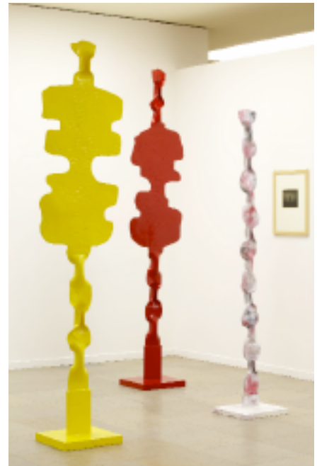
Fig. 2 Alain Kirili, Plastiras , from Un coup de dés jamais n'abolira la sculpture , 2005, painted, forged iron, 9 x 13 x 10 feet (274 x 400 x 310 cm) installed at the Musée d'Orsay with photographs of Rodin's Balzac by Edward Steichen, 1908.

The pleasure experienced in sculpting flesh, says Kirili, is an antidote to the puritanical denial of the body. Lachaise perceived this denial in 1909. "This good, modest city Boston," he writes to his Paris friend, "plans to prohibit [Isadora Duncan] when she returns because she dances a bit too nude: as for myself, I feel that completely nude would be a beautiful thing, too. It's phenomenal how these